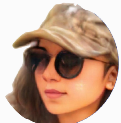
Shazam ! IPC

These famous people do not require more and more attention.