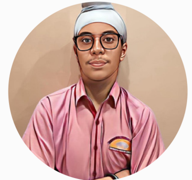
SARDAR JI UNCOPUOS