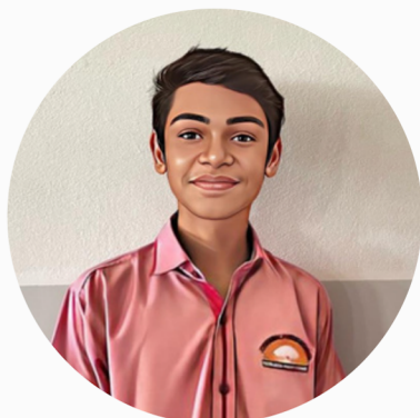
Suvaniti in blasphemy UNPBC

These famous people do not require more and more attention.