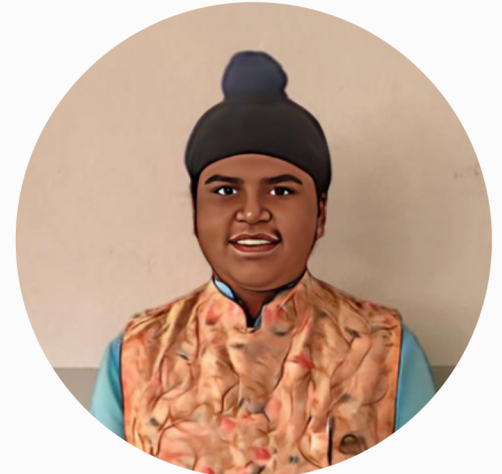
Bal Puraskar Awardee AIPPM