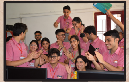
JODHAMALYC- THE CRADLE OF YOUTH SHAPING