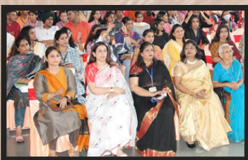
TO ANOTHER YEAR AT JYC...

Each year, JYC sets the next year's expectations higher, showcasing intricately planned committee proceedings, profound debates, entertaining socials, and ever-lasting memories. Annually, JYC is the talk of the town, everybody's favourite topic of gossip (Hints to the Gossip Guy ;)). In this dynamic exchange, borders dissolve, and the mosaic of human knowledge expands to encompass new horizons. As participants share their knowledge and opinions, they collectively shape the contours of the future. Committees facilitate deliberations about emerging technologies, scientific breakthroughs, policy reforms, and social paradigms. Delegates with portfolios from various corners of the globe will bring with them not only their expertise but also their cultural identities.