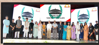
JYC'22 THE BIGGEST YOUTH CONFERENCE IN JAMMU IN ITS MUN HISTORY